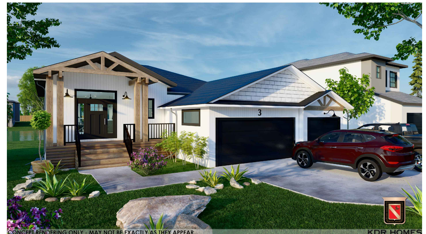
CONCEPT RENDERING ONLY - MAY NOT BE EXACTLY AS THEY APPEAR. CONCEPT RENDERING ONLY. MAY NOT BE EXACTLY AS THEY APPEAR.